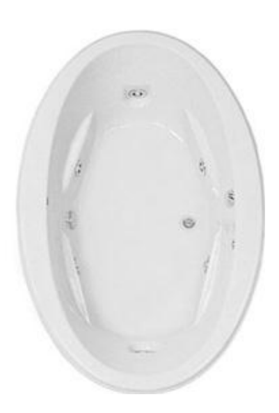
72"x44"x21" Shipping weight - 140lbs